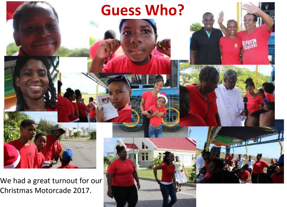
We had a great turnout for our Christmas Motorcade 2017.